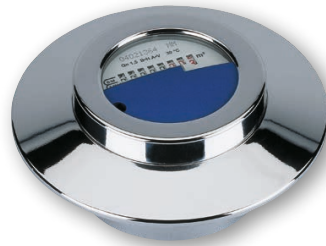
In-wall compact meter for modular radio system (ECO)