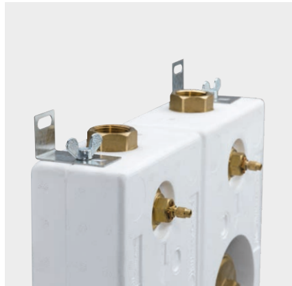
Example of mounting incl. mounting brackets