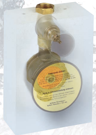
Installation thread the cost effective alternative