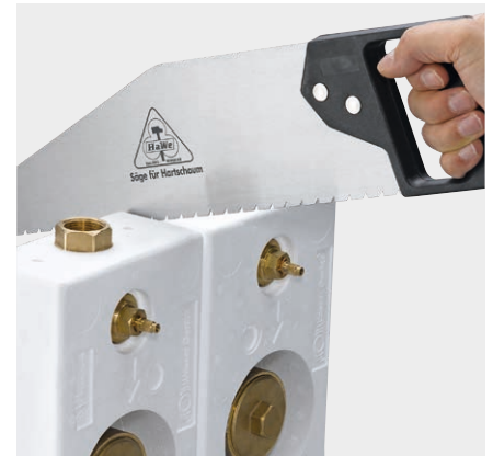
Separation of the installation rack (into a single rack) with a common handsaw