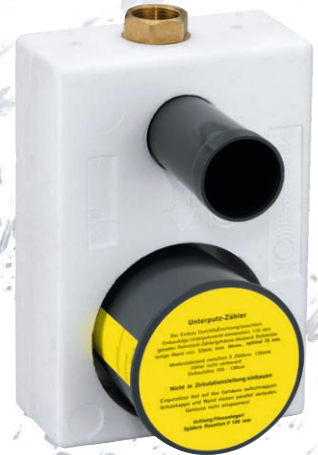
Installation rack single