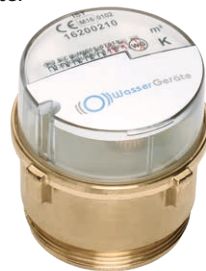
The intelligent measuring capsule system: Unimeter