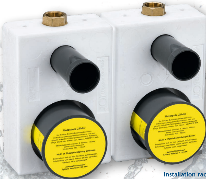
Installation rack double incl. accessories, mounting bracket